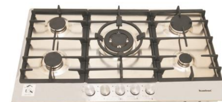
SBH 9410 WS

60 X 60 Full Stainless Steel | Auto Ignition 4 Gas Burner with cast iron grid