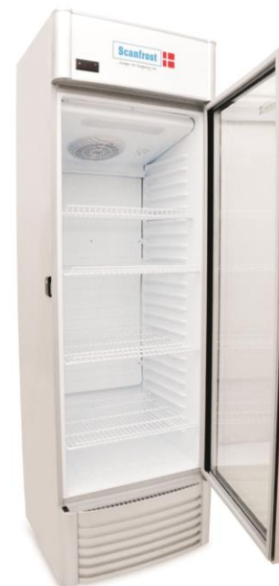
SFUC 300 / SFUC 200

Wide space for more food stuff Low Voltage Start Ability | 3 Layered Shelves Anti Rust Coated body surface | Temperature digital display 2 Year Warranty | Lockable with key Corporate branding (optional) Inox Finish