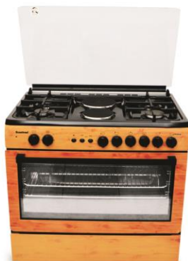
SFC 9425 NG

Rapid, Semi-Rapid, Triple and Auxiliary Burners Cast iron pot stand | Stainless steel body with Muscular top Digital display with soft touch switches for lamp, turnspit and electronic timer Oven burner and grill burner with turnspit Drip Tray | Auto Sparker within control knob for Oven & Grill