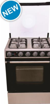
SFC 6402 SS

60X55 CMS | 4 Gas Burners-Lamp-Gas Oven & Grill Classic Home Look | Stainless Steel Finish/ No rust Life long . Double Glass insulated Door | Cast Iron Pot Stand . Auto Rotisserie bar in Oven for even Roasting. Auto ignition burner including Oven & Grill. Oven lamp | With 2 Years PAN Nigeria Warranty