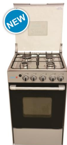
SFC 5042 S

50X55 CMS | 4 Gas Burners-Lamp, Gas Oven Oven Tray | Oven lamp | SS texture finish Double Glass insulated Door | Contra ss & Grey Finish 2 Years PAN Nigeria Warranty