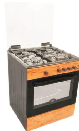
SFC 6402 NG

Big and Small Hot Plates | Robust cooktop. Triple, Semi-rapid and Auxiliary Burners Cast iron pot stand | Stainless steel body Digital display with soft touch switches for Turnspit, Lamp and electronic timer. Oven burner and grill burner with turnspit. auto ignition for all burners including Oven & Grill