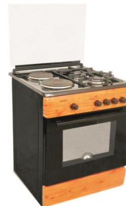
SFC 6222 NG

60X55 CMS | 4 Gas Burners-Lamp-Gas Oven & Grill Classic Home Look | Stainless Steel Finish/ No rust Life long . Double Glass insulated Door | Cast Iron Pot Stand . Auto Rotisserie bar in Oven for even Roasting. Auto ignition burner including Oven & Grill. Oven lamp | With 2 Years PAN Nigeria Warranty