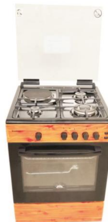
SFC 6312 NG

Auto ignition | Gas oven & grill Roasting turnspit | Dripping tray | Knob guard Casted pot grid | Oven wire shelves Fire resistant cable | Enamel black top finish Oven Temperature indicator | Elegant glass cover Wood outer finish