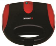
Sandwich Maker – SFSM2SLN

Features: 2 Slice sandwich maker Non stick surface- so easy to swipe clean. Bright red & black superior finish